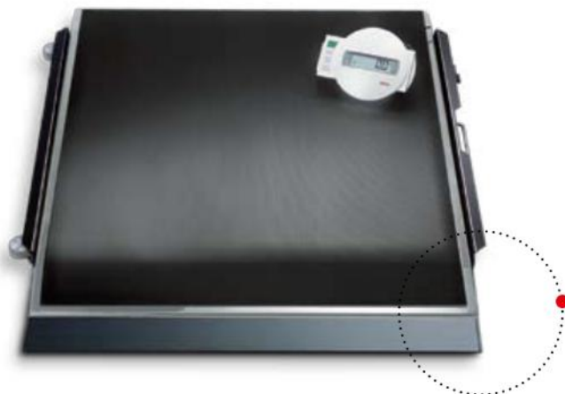
A ramp for easy roll-on of wheelchair is included in delivery.