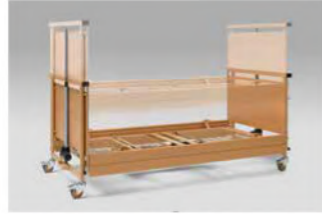
Adjustment range from 30 to 80 cm.