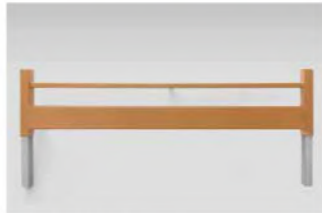
Bed extension (also for retrofitting).