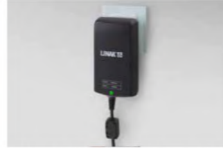
Electronic (SwitchMode) power supply unit integrated immediately downstream of the mains plug.