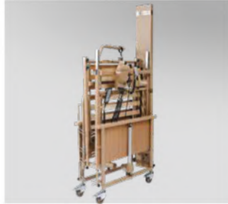
Compact delivery and storage on storage aid/transportation aid (similar to illustration).