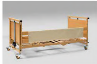
Foam leather cover.