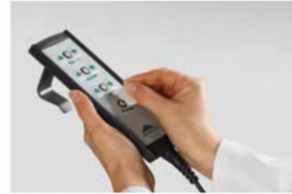
Handset with selective locking function.