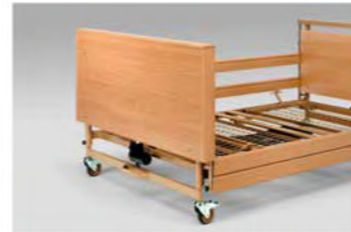
Wooden panels to cover the chassis (also for retrofitting).