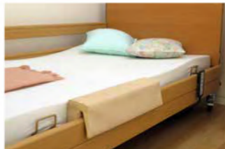
Extension cushion to place over the full-length safety side.