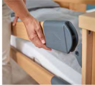
Tool-free safety side installation with Easy Click system.