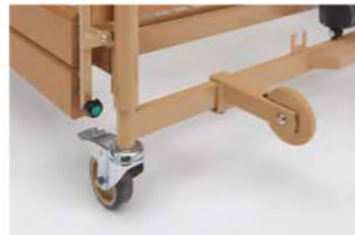
Wall deflection roller including holder.