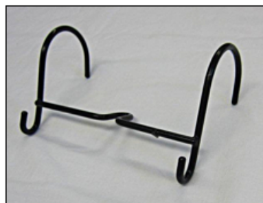
SJIDC-P1 coated in black PVC