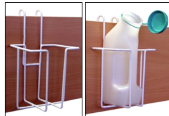
SJSUBH-P2 and with LM3041