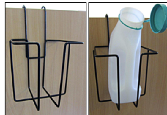
SJSUBH-P1 and with LM3041

Why choose black plastic instead of white?