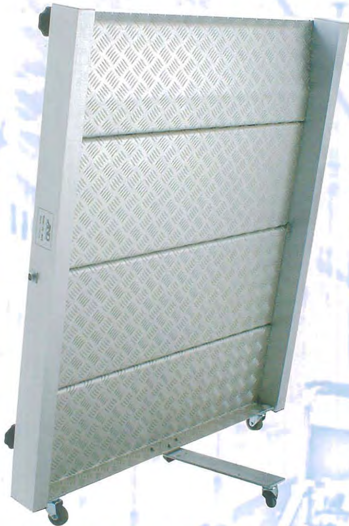
Castor Design for transport