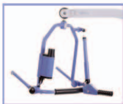
4-point positioning cradle (electric version shown)

The position achieved by adjusting the loops will depend upon the height and build of the patient. The rule of thumb is the shorter the shoulder straps the more upright the client will be.