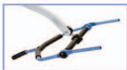
4-point shallow cradle (Manual - Advance lift only)

The 4-point positioning cradle uses the Securi3 safety clip system and adjustment is made by rotating the cradle handle either down or up to obtain an upright or reclined position for the patient. Both manual and powered cradles are available.