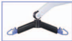
6-point spreader bar