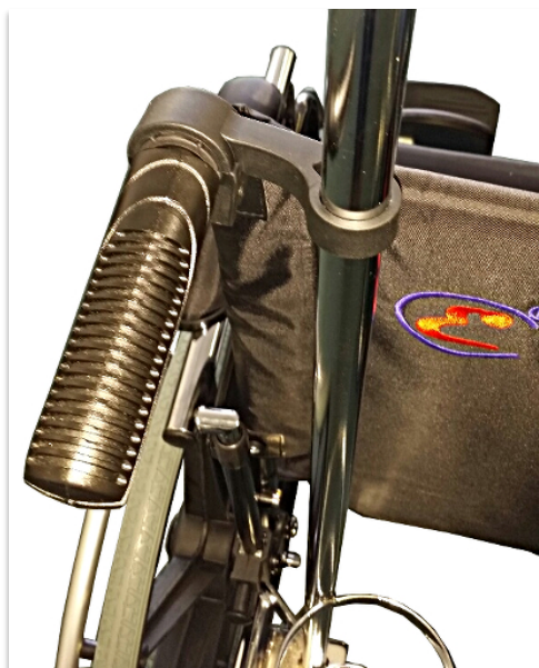
Attaches at handle