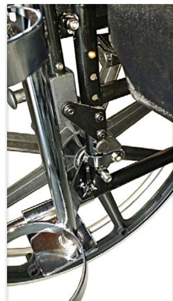
Attaches at axle