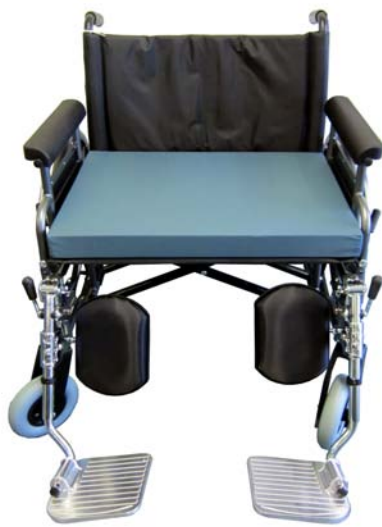
Rivet positions for LM9808 Wheelchair

In hospitals and nursing homes, theft of wheelchairs is often a common problem. Because most wheelchairs can be folded, they can easily be placed into the boot of a vehicle. These losses causes expense and inconvenience to institutions that rely on wheelchairs for the safe transport of people. Theft is less likely with a non-folding wheelchair.