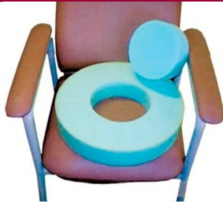
Foam Doughnut Cushion (insert included) - FQ712551