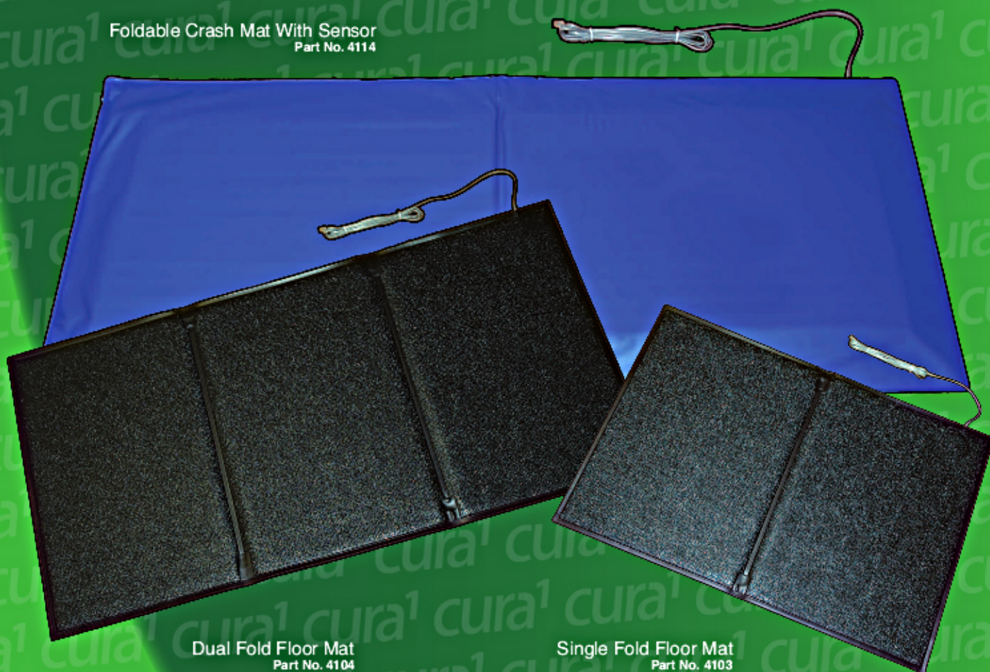
Dual Fold Floor Mat Part No. 4104