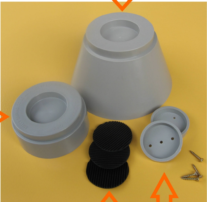
Part Number 015-7 "Bed Raiser Biscuit" (screws included)