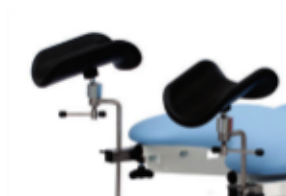
Under knee stirrups