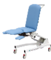
Removable end section