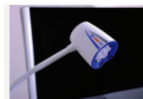
White LED light