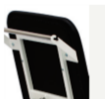
Paper roll holder